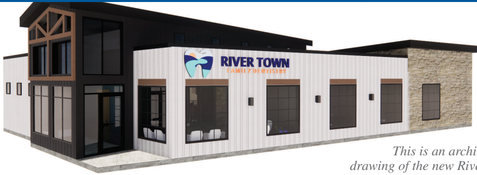
This is an architectural drawing of the new River Town Dentistry opening in January in Guttenberg